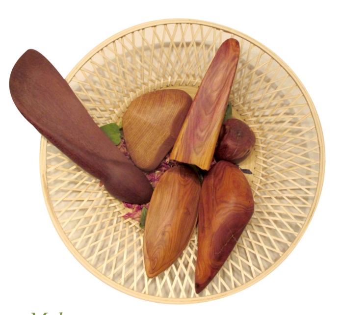
Melon Art.7_We're All Equal Before the Law Annatto Art.19_Freedom of Expression Pomegranate Art.22_Social Security Maple Art.2_Don't Discriminate Echinacea Art.4_No Slavery Ayoyote Art.17_The Right to Your Own Things