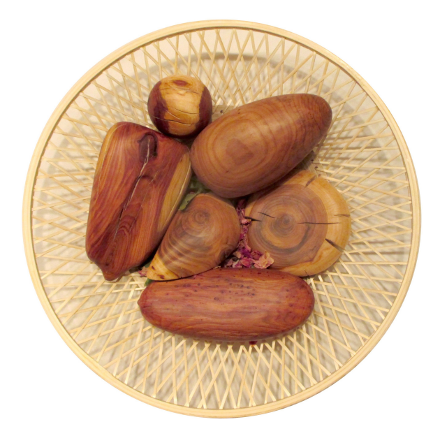
Corn Art.30_No One Can Take Away Your Human Rights Avocado Art.16_Marriage and Family Rheedii Art.18_Freedom of Thought Flamboyant Art.11_We 're Always Innocent Till Proven Guilty Mustard Art.23_Worker's Right Apple Art.3_The Right to Life

Chickpea Art.21_The Right to Democracy Watermelon Art26_The Right to Education