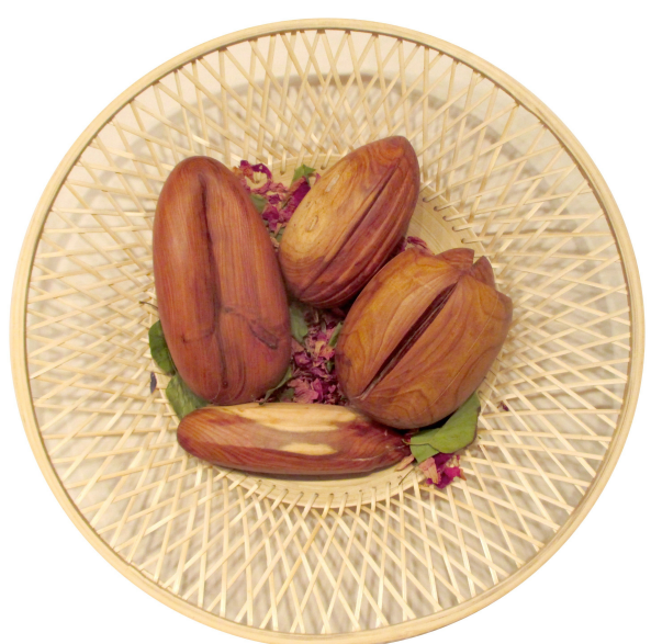
Cherry Art.13_Freedom to Move Cocoa Art.12_Right to Privacy Lotus Art.24_The Right to Play Rice Art.10_The Right to Trial

Bean Art.5_No Torture Seedbox Art.14_ Right to Seek a Safe Place to Live Date Art.9_No Unfair Detainment Sunflower Art.28_A Fair and Free World Buckwheat Art.25_Food and Shelter for All